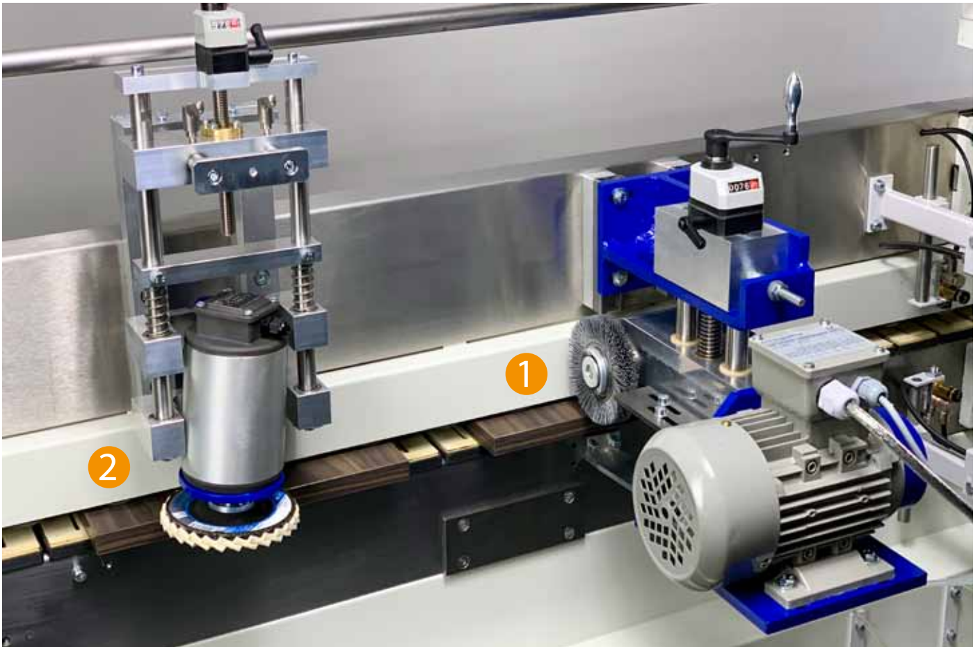
(1) Structuring brush unit (2) Horizontal brush unit